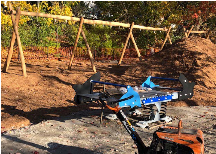
Rae Contracting laid down the base for the path and the ground surface near the swing and see-saw structures