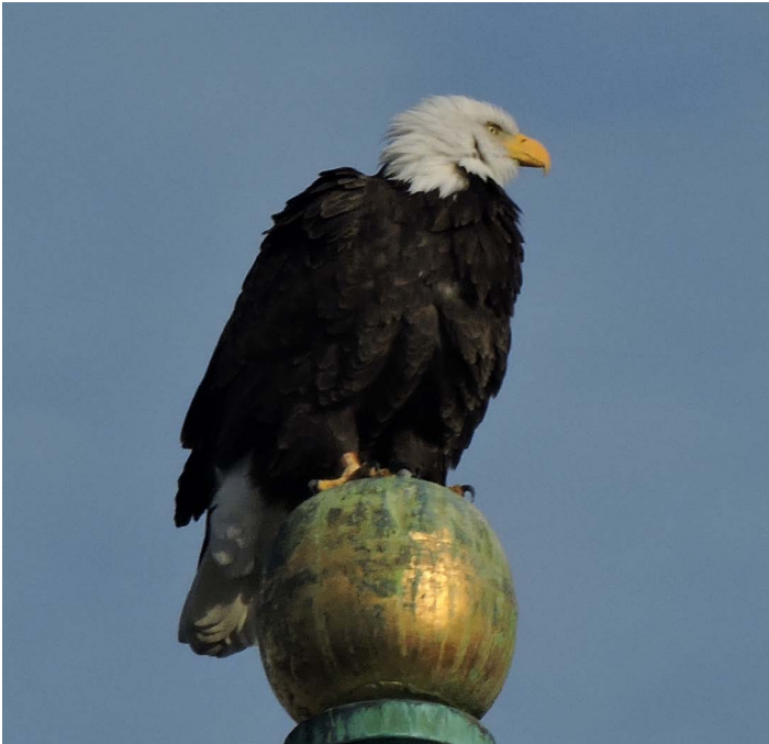
This eagle, the female of the pair nesting in Mt. Pleasant Cemetery, has been perching regularly on the steeple of Calvary Methodist Church on Linwood Street, one block from the Park