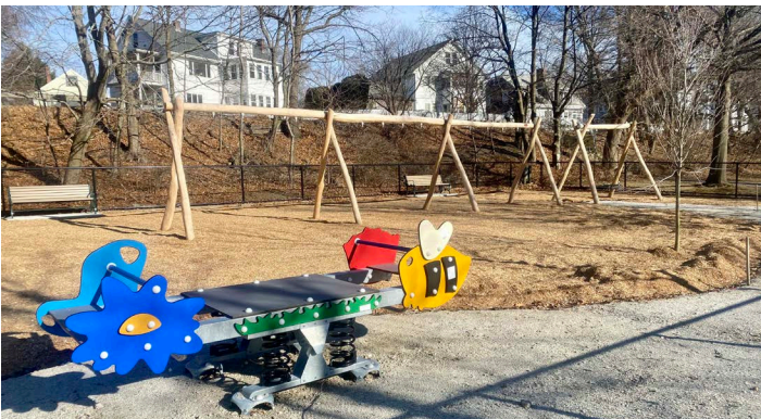
Viewing the see-saw and the swing structure in the renovation, children can't wait for the playground to open