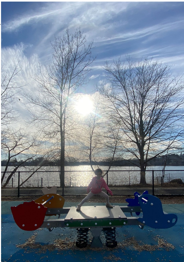
The days getting longer means more playtime at the Spy Pond Park playground