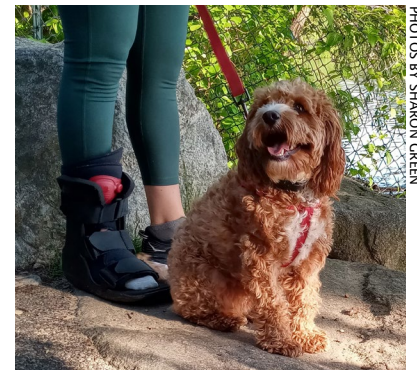
Gruffy and Oliver enjoy Spy Pond Park on-leash