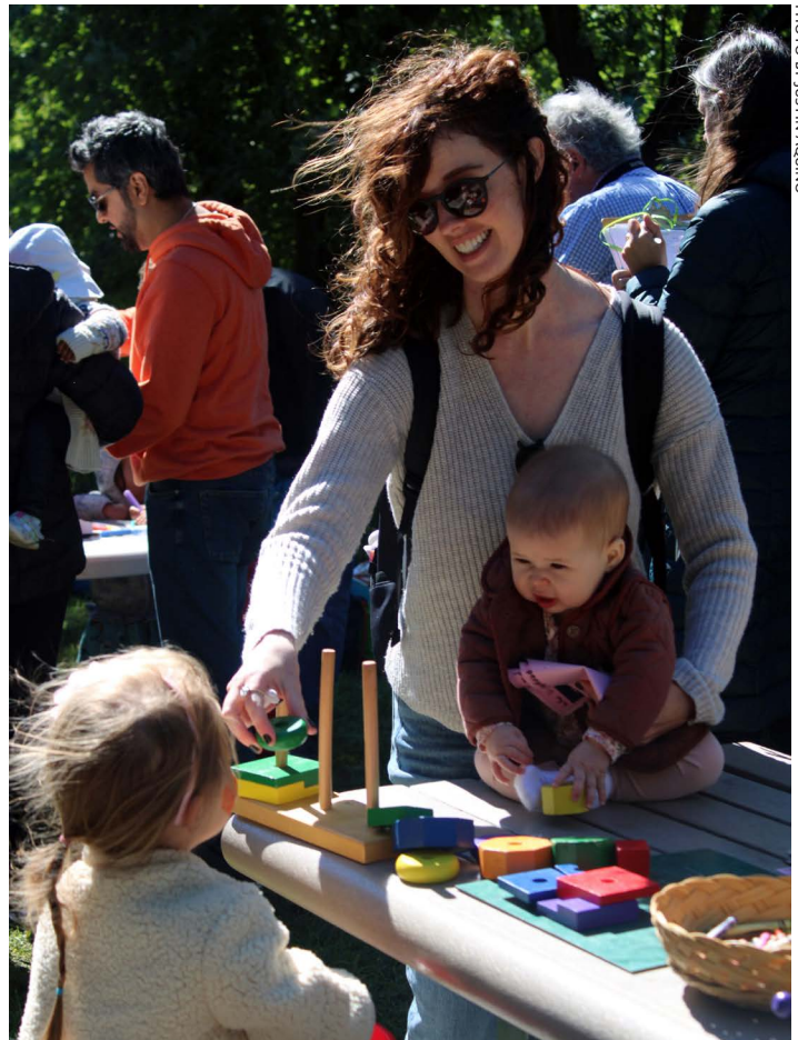
Playing at the toddler table was fun for all on the windy Fun Day