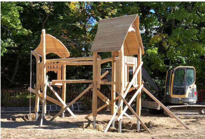
Building the new climbing structure in SPP playground