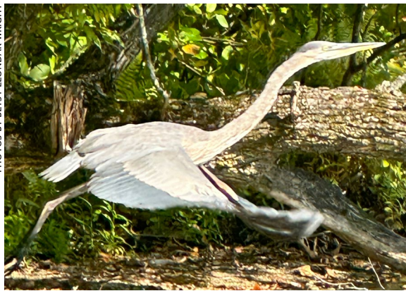
Great blue heron takes flight

Photographing the great blue herons in flight was my unattainable holy grail for years, finally achieved in this sequence in September.