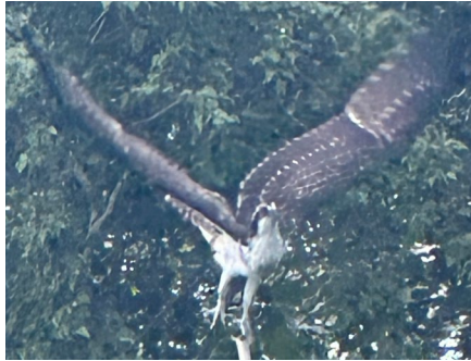
Osprey spotted at Spy Pond

I often saw a pair of ospreys circling far overhead, including this one.