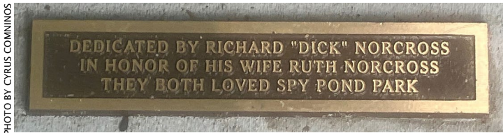
A new bike rack was installed at SPP thanks to the generosity of the late Dick Norcross, longtime faithful FSPP volunteer