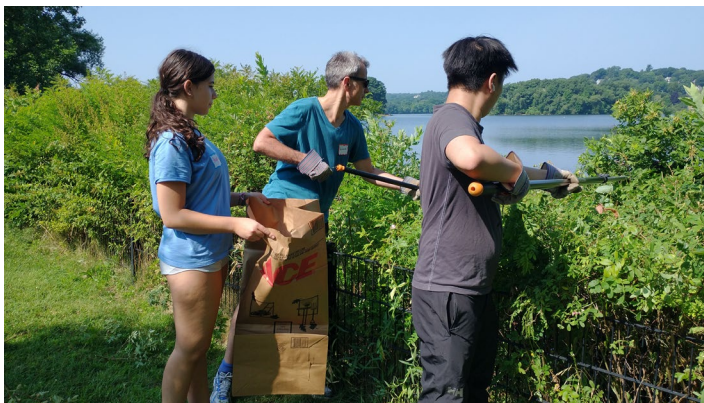
Trimming the bushes near Linwood Circle will allow park visitors to have a better view of beautiful, glistening Spy Pond

Open soil around new plants often invites weeds that encroach on the new plants. Volunteers cleared away the weed growth from shrubs planted in 2023. We hope to put a native ground cover around them in the fall.