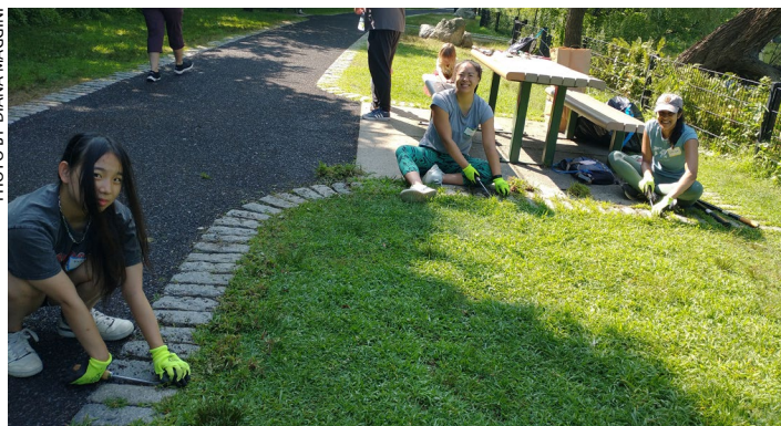
Grooming the cobblestones lining the path through the park

We want to thank the many individual volunteers who did such a great job digging holes, preparing the soil, and helping to plant these 38 shrubs along with uprooting and removing invasives. These volunteers included scouts and their parents from Troop #306 who also helped weed between the cobblestones lining the path through the park. Elementary School members of “Kids Saving the Earth” and their parents also helped with the weeding and with sweeping the main path through the playground. In addition, volunteers from People Making a Difference® trimmed and pruned a row of overgrown hedges at Linwood Circle that were blocking a popular and beautiful view of Spy Pond for the many visitors who enjoy this and the many other beautiful views of the pond.