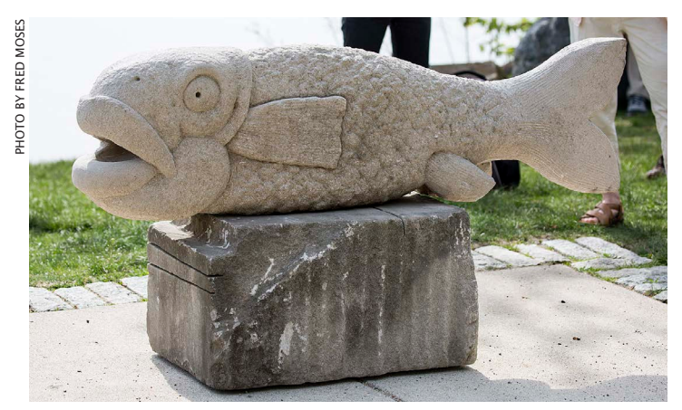
"Petrified Fish", limestone, by Tim DeChristopher, stood on a concrete slab soon to be re-occupied by a park bench

This exhibit, created by Arlington Public Art, and sponsored by Arlington Recreation, opened May 9 with about 50 people attending that beautiful sunny afternoon reception and guided tour. The temporary exhibit featured sculptures by 12 local artists who used the site to inspire their work. You can get a glimpse of the works in a slideshow at: http://www.yourarlington.com/component/categoryblock/spy-111514.html?cbprofile=1.