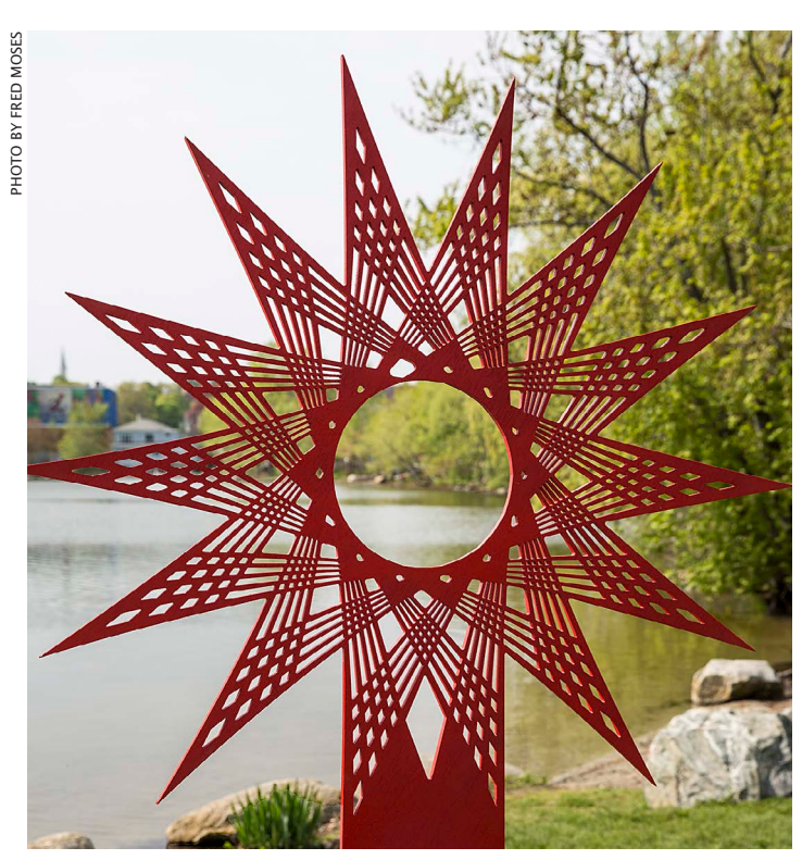
"Spy Glass," painted wood by Michael Dewberry, stood at Linwood Beach before a view of the Spy Pond Mural across the water.

This exhibit, created by Arlington Public Art, and sponsored by Arlington Recreation, opened May 9 with about 50 people attending that beautiful sunny afternoon reception and guided tour. The temporary exhibit featured sculptures by 12 local artists who used the site to inspire their work. You can get a glimpse of the works in a slideshow at: http://www.yourarlington.com/component/categoryblock/spy-111514.html?cbprofile=1.