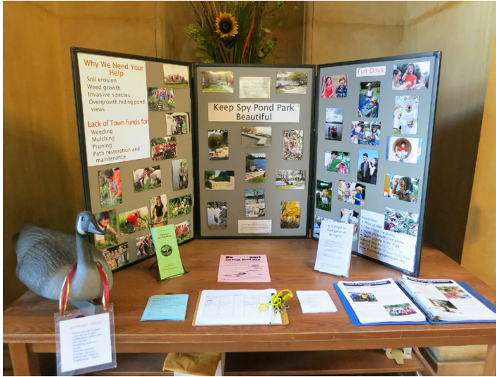
Friends of Spy Pond Park Robbins Library display in March

The Robbins Library in Arlington Massachusetts was built in 1892 in the style of a Renaissance Palace. The front entrance was modelled after The Cancelleria Palace in Rome. As you enter through this lovely doorway, immediately on the left there is an area provided by the library for displays by non-profit organizations. In 2015, the month of March was dedicated to anything and everything about Spy Pond and The Friends of Spy Pond Park. A lovely photo board depicting many of the activities available in the park as well as flora and fauna indigenous to the area created a colorful backdrop. It showcased many of our members and their families enjoying all that Spy Pond and Spy Pond Park have to offer. One could also page through an adjacent notebook containing newsletters from prior years enabling those interested to follow our progress in beautifying and rehabilitating the area. Most of this work is done by volunteers like you and by volunteer organizations throughout greater Boston. The FSPP supplied information on the local geese population that is multiplying rapidly. PLEASE DON'T FEED THE GEESE! It is illegal by town bylaw and injurious to the geese and the park. The Arlington Advocate on Thursday, March 12, even wrote an article on this topic and featured our signature goose in the accompanying photo: http://arlington.wickedlocal.com/article/20150311/NEWS/150318814/1995/NEWS