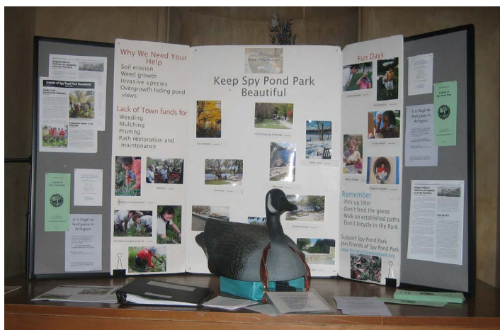
The FSPP exhibit at EcoFest 2013.