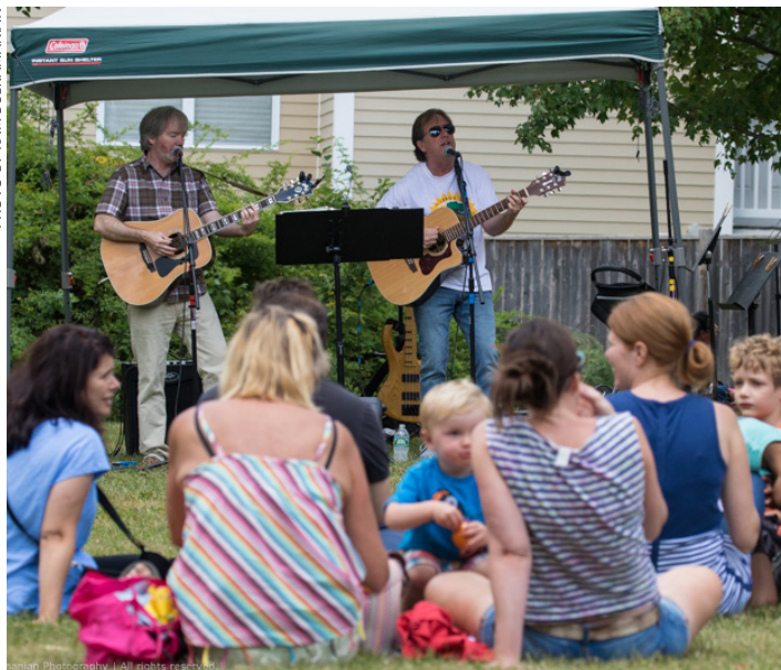
Aunt Mimi, a guitar duo, played pop, rock and folk classics to entertain the crowd