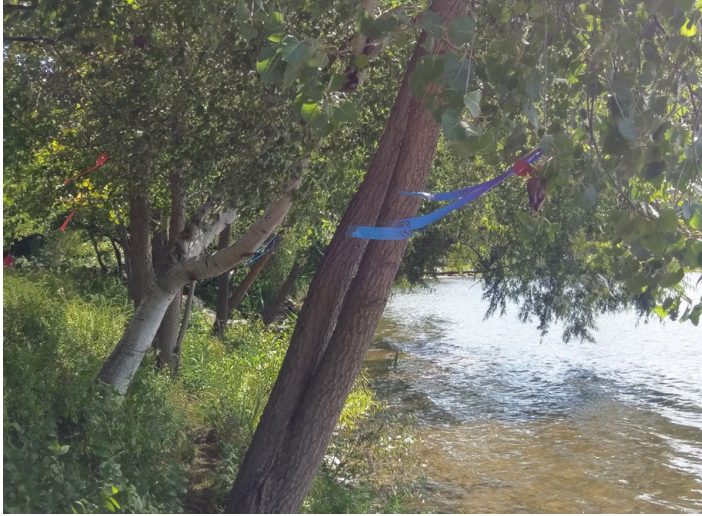
Trees surveyed for the Spy Pond Edge Protection and Erosion Control Project are designated by flags, which should remain attached through the winter

The Spy Pond Shoreline Stabilization Project is being managed by the Conservation Commission and funded by Community Preservation Act (CPA) funds, administered by the Massachusetts Department of Revenue. The primary goals of the project are to preserve shoreline habitat and improve water quality while addressing erosion. To ensure success of the project, the Conservation Commission is relying on community partnerships to educate the public and help control access to unauthorized paths that lead to bank erosion.