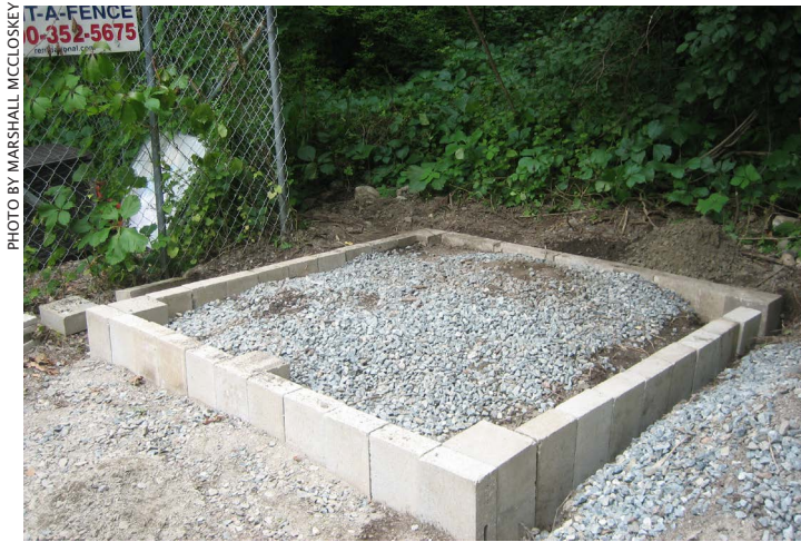
Original shed foundation

So, on the July 12, 2014, Work Day the firm of JM Construction came to supply a ramp for the shed. JM Construction did a thoroughly professional job, far exceeding expectations, building a ramp that would, no doubt, allow us to store a small tractor in the shed if we wanted! The ramp is constructed of durable plastic decking with 5 sturdy lumber stringers supporting it.