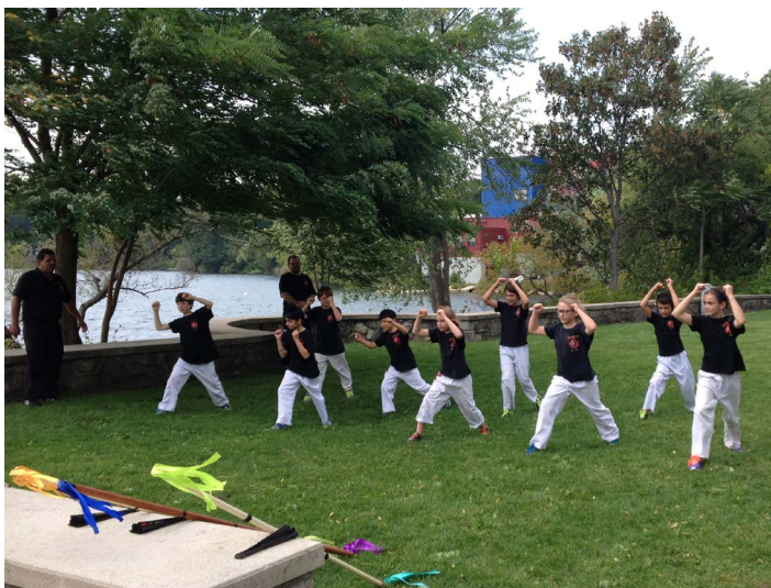
Students of Zhen Ren Chuan demonstrate their skills, entertaining park visitors on Fun Day