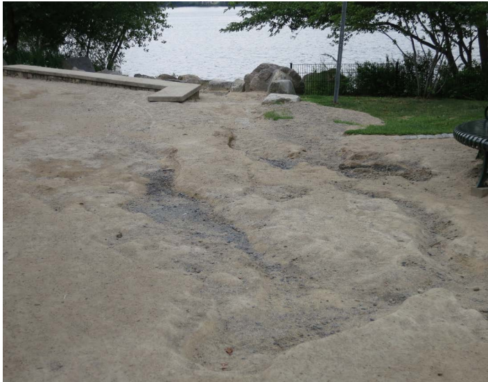
Erosion washed path material into the pond