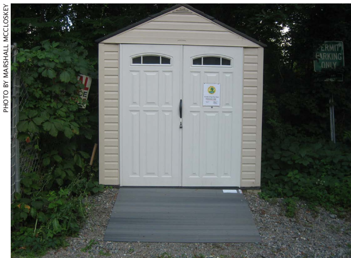
New shed ramp built by JM Construction

Editor's note: JM Construction (617-212-3420) specializes in both small and large building projects, from full house construction to additions, porches, decks, roof framing, siding and roofing, and has many satisfied customers in Arlington and surrounding communities.