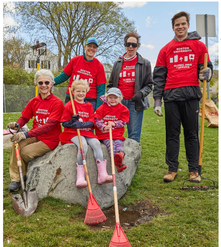
BU alumni rest between activity at Linwood Beach on the windy day in April doing service for BU's Global Days of Service in Spy Pond Park

Liability waivers are required for all participants in the above Work and Fun Day activities. If you are working, please download the form from the FSPP website, fill it out beforehand and bring it with you. Children below 18 years of age must have parental signature to participate in Spy Pond Park activities.