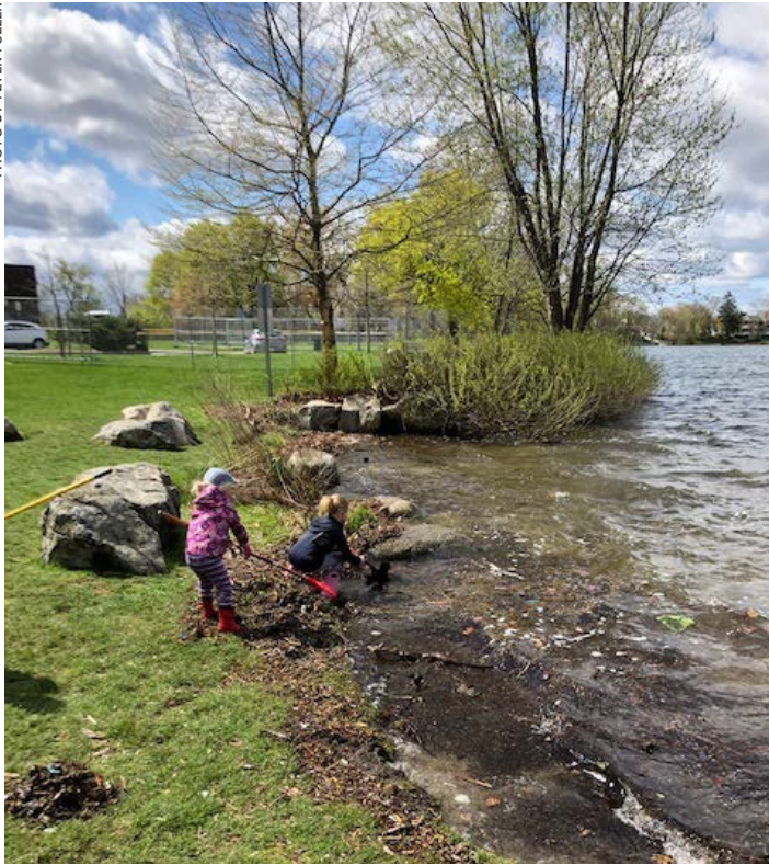
Young volunteers helping with the raking at Spy Pond Park as part of BU's Global Days of Service

Giving back to the community is something that I believe is worthwhile from many sides. On one side, it is empowering to set to work improving the local community in which you live. On another, it is inspiring to create new ties with people who share your ambitions for serving the community that has given you so much. On a third, it feels good to put in effort and see a positive impact on an environment, especially to see that effective change multiplied by the effort of other volunteer team members. And there are yet many more sides to community service which are rewarding! During the first Work Day of 2019, BU alumni set to work on the cleanup of Spy Pond Park as part of the Boston University Alumni Association Global Days of Service during the month of April. The team worked hard to clean up debris along the shore of the park, pick up refuse that had accumulated over the winter months in the pond, gather fallen branches scattered across the lawns of the park, and rake leaves left over from the fall and winter, to begin beautifying the park for this season.