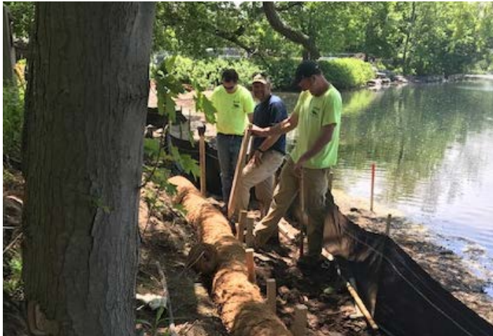
Haven Contracting workers install coir fascine along Spy Pond Park shoreline to curb erosion and facilitate new plant growth

The schedule for this project is always dependent on weather. At this time, however, Haven Contracting will continue to install the coir fascines for Spy Pond Park into next week, will start planting mid-next week, and will install helical piers for the overlook in 2 weeks. Spy Pond Park will likely be closed starting Monday, 6/24 for 7-10 days to install the porous path. They will complete a portion of the path by 6/30, open for the 4th of July and close for the remainder after 7/7 for 7-10 days to complete the path. The playground will remain open throughout this period.