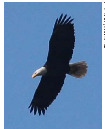
Mature bald eagle