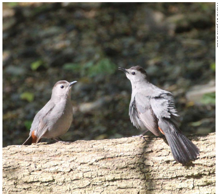
Two gray catbirds spotted in Spy Pond Park