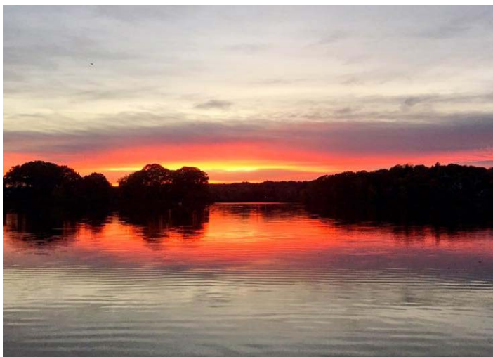
Fire in the Sky over Spy Pond from Spy Pond Park