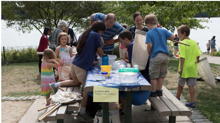
Children and adults enjoyed "Catching a Bug" on Fun Day 2016

The most enjoyable thing about planning Fun Day is connecting with so many wonderful people. You could share that enjoyment too!