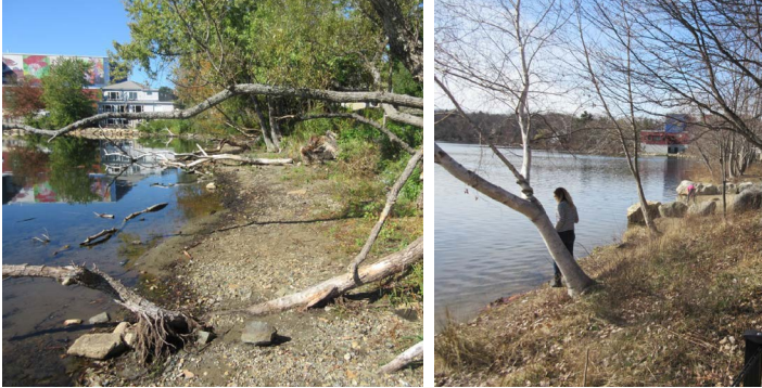
Portions of the Spy Pond shoreline for which the Conservation Commission is requesting CPA funds

As I have reported previously to the FSPP in the spring of 2013, members of the Arlington Conservation Commission noticed that the shoreline along Spy Pond was deteriorating, with the potential for long-term bank failure adjacent to Spy Pond Park. The erosion was a result of high recreational pressure and stormwater inputs from overland flow and wave/ice action.