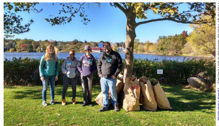
People Making a Difference® volunteers rest after collecting many bags full of autumn leaves and natural debris in brown paper bags and invasive plants in black plastic bags

People Making a Difference® (PMD) PO Box 120189, Boston, MA 02112-0189 781-963-0373 http://www.pmd.org lori@pmd.org