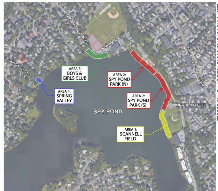
ILLUSTRATION BY CHESTER ENGINEERS (MAP DATA: GOOGLE)

Note: for more information please go to http://www.arlingtonma.gov/town-governance/all-boards-and-committees/conservation-commission/projects and refer to the public meeting materials from this fall.