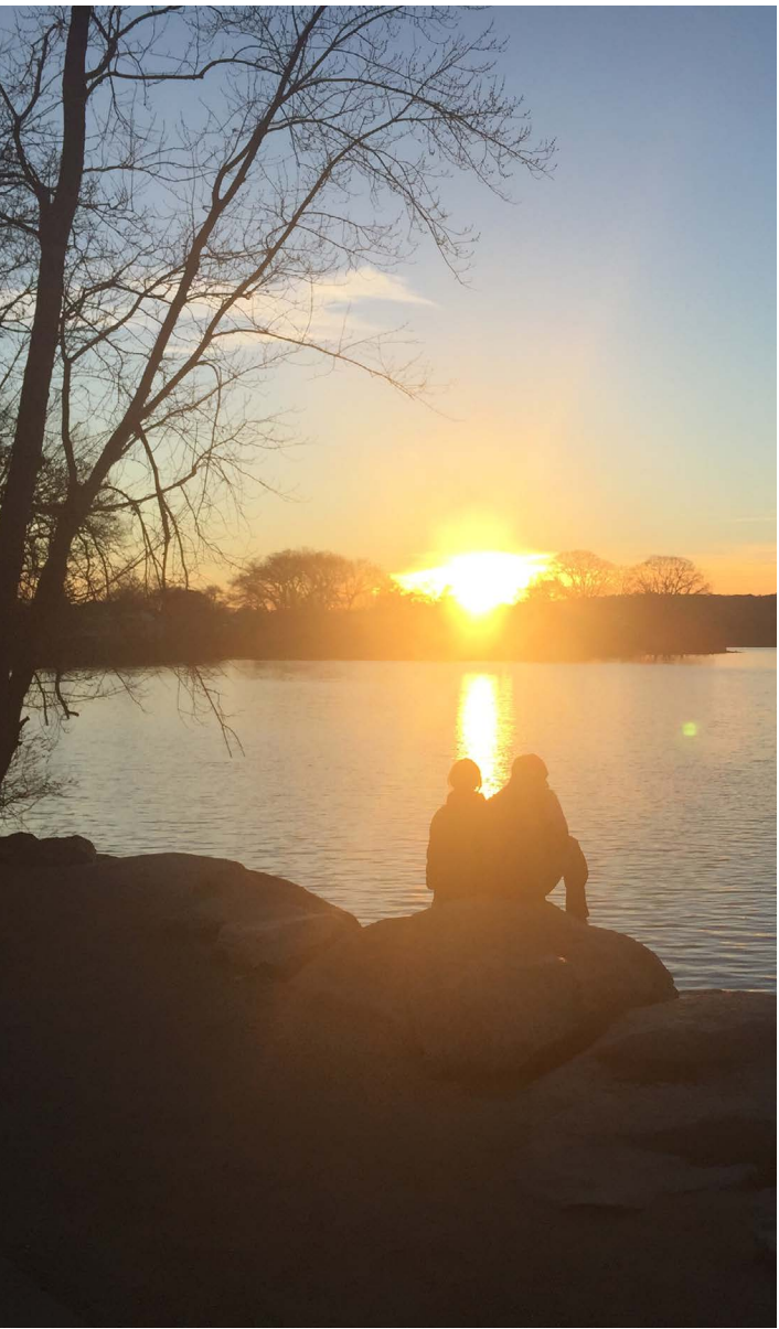
Watching the Spy Pond sunset