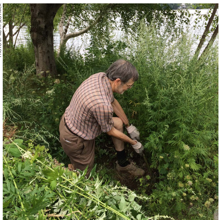
Digging up invasive plants