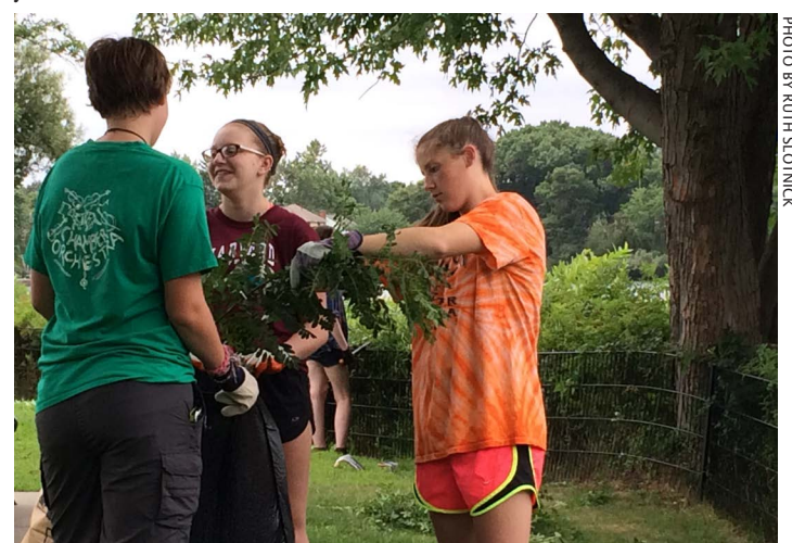
Arlington/Belmont Crew Team volunteers fill bags with refuse

At the end of the day we take a few minutes to admire the results of our handiwork and snap some group pictures. In just a few months we will start again and are already looking forward to the high school teams that will greet us for our spring-cleaning! Thank you, from your admiring Friends of Spy Pond Park. See you soon!