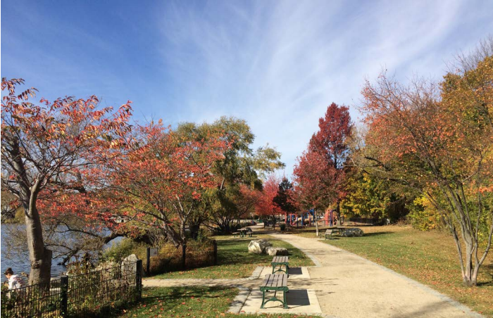
Spy Pond Park in Autumn

The Arlington Award Program was established to recognize the best of local businesses in our community. The organization works exclusively with local business owners, trade groups, professional associations and other business advertising and marketing groups. Their mission is to recognize the small business community's contributions to the U.S. economy.