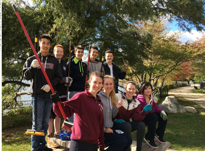
Arlington Swim Team volunteers raise their tools in jubilation

Every year, the Friends of Spy Pond Park (FSPP) "Work Days" – days when we literally spend hours pruning overgrown hedges, sawing off dead tree limbs to create perfect views of the pond, gathering bags of recyclable yard waste, plucking invasive plants from their stubborn roots, and weeding between the cobblestones to perfection, join the less glorified tasks of trash pick-up and sweeping storm drains until winter arrives providing a much needed break from human hands. These monthly horticultural acts, performed by volunteers and led by a group of board members, many who have served the organization informally since the 1990s, help to preserve the delicate beauty of our glacier formed kettle pond in a Swiss-like fashion from late spring until early fall.