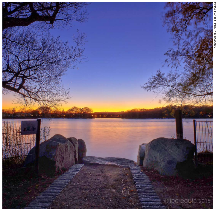
Sunset over Spy Pond