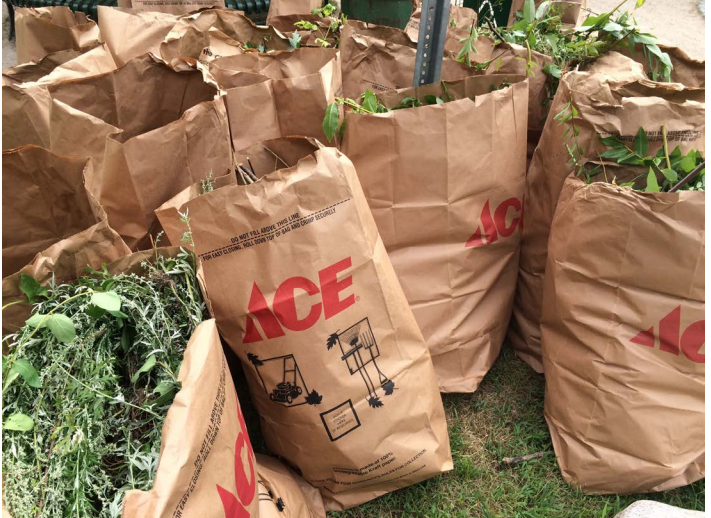
Bags of natural debris from a Spy Pond Park work day