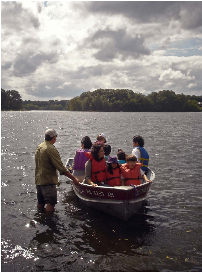
Passengers return from a tour of Elizabeth Island with the Arlington Land Trust on the September 8th Fun Day