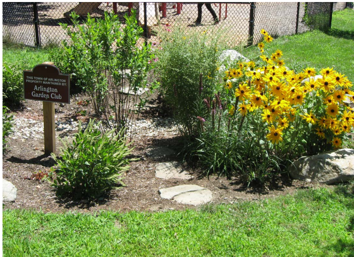
Thanks to the Garden Club for maintaining the SPP rain garden