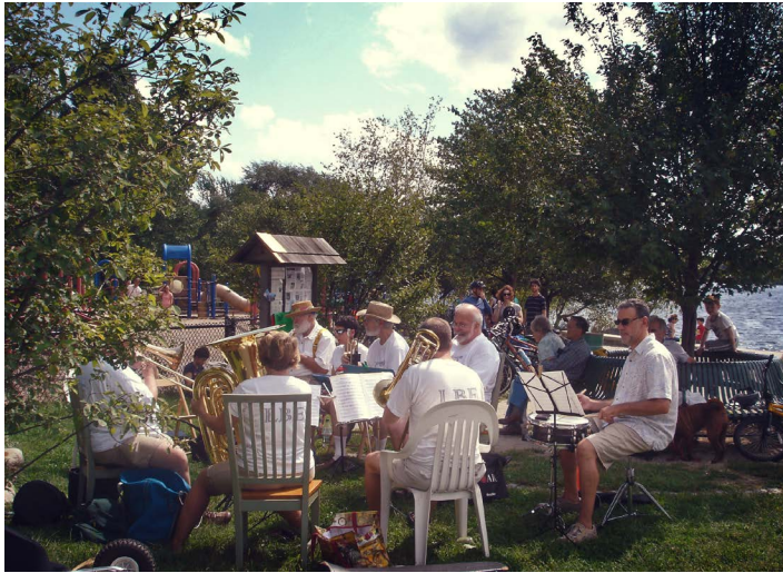
The Lokensgard Blechbläser Ensemble entertains on Fun Day

It was so windy on Saturday, September 8 that the Friends of Spy Pond Park's (FSPP) Fun Day almost got blown away. Paper puzzles, bark boats and newsletters blew off tables and flew around the park like confetti. The plan to have canoes and kayaks available to paddle to Elizabeth Island for the Arlington Land Trust's tours had to be scuttled, though the crew team's motor launches were still able to ferry dozens of people across the pond.