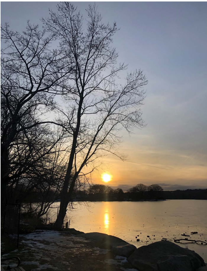
Sunset over Spy Pond January, 2020